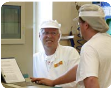
The integrated system means a substantial rationalization which gives more time for planning.

Production planning, raw materials handling, batch handling, production statistics, traceability and reports are all integrated via a single operator interface. The operator sees no difference between his/her operating system and MES. Everything is presented in iFIX process pictures